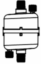
2C 1/4" Compression (Jaco compatible)