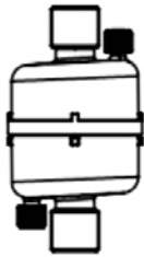
3NF 3/8" NPTF