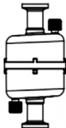
MT 1/2" Tri Clamp