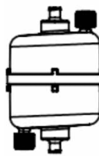
LF Luer lock female