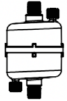
2N 1/4" NPTM