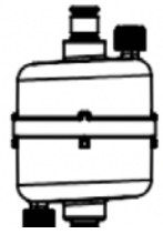
2Q 1/4" Male quick coupling (PLC/40-S)