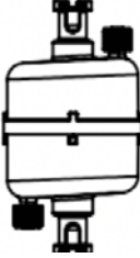
1QF 1/8" Female quick coupling (PMC/20-S)