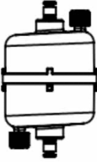
1Q 1/8" Male quick coupling (PMC/20-S)