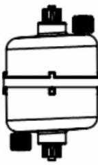
LM Luer lock male