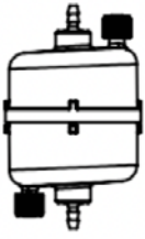
1H 1/8" Hose barb