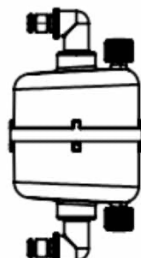
1QE 1/8" Male quick coupling, elbow